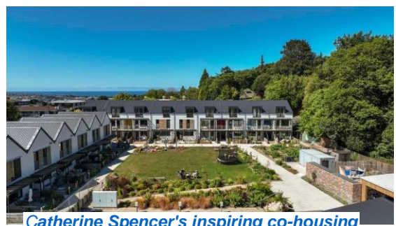
Catherine Spencer's inspiring co-housing home

Inspiration – Catherine Spencer's Dunedin home in the <u>Toiora</u> <u>co-housing</u> project where, among other things, they have effective passive heating and, one lawnmower between 24 houses.