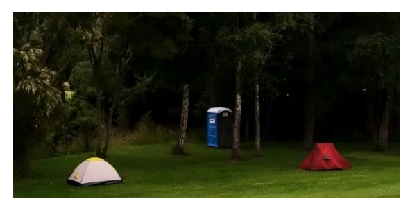
Other people's homes at Summer Gathering

Finally, It is summer, enjoy this piece from Planet Local Summit or a Very English But Very Restorative Book